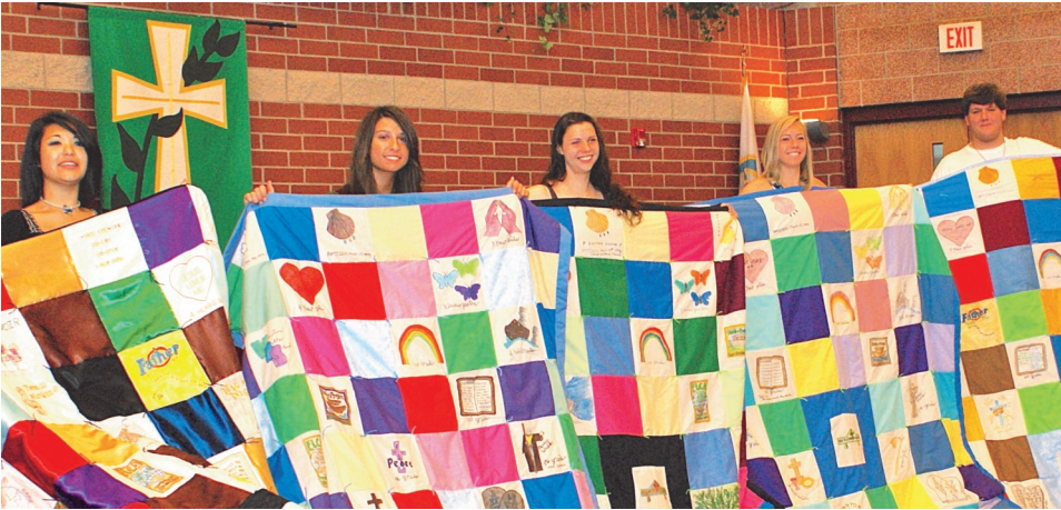
These seniors had their quilts blessed on June 6, 2010.