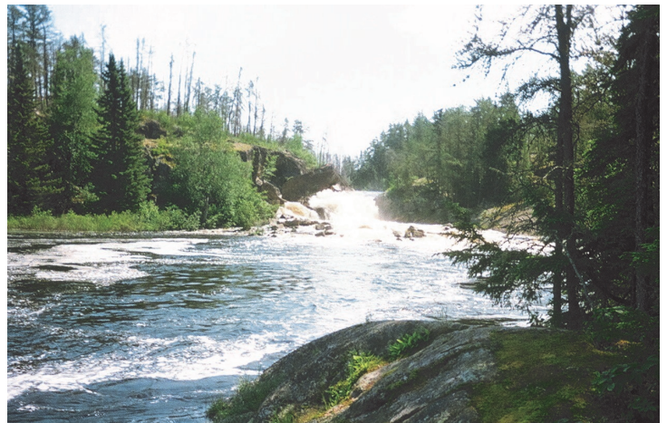
Bissett, Canada, High Adventure Canoe Base