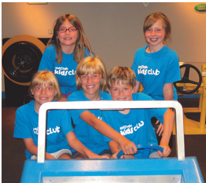
Campers having fun at Kohl Children's Museum