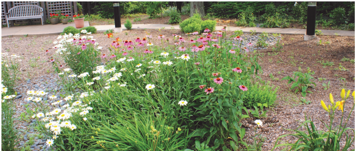
Messiah's Courtyard, July 4, 2010