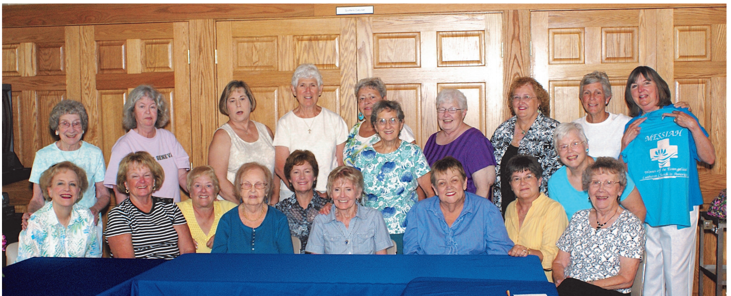
Deborah Circle enjoyed their annual luncheon on July 14, 2010.